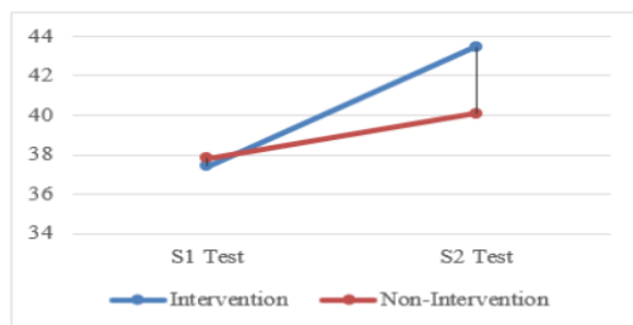
Fig. 2. Means S1 & S2 Test of Mathematical Literacy

activities have better mathematical literacy skills. VMK as a digital media has proven effectiveness value to support mathematics literacy-based activities.